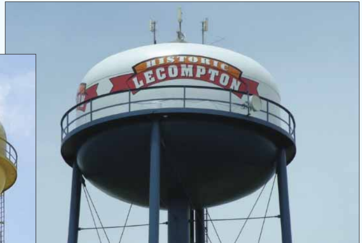
Since the tank is located next to the Lecompton exit off of the I-70 / Kansas Turnpike, Douglas RWD No. 6 approached the Lecompton Historical Society to see if they had an interest in having their logo on the RWD's tank. They agreed that having their logo on the RWD's water storage tank would help to promote the history of Lecompton.

If you are ever on the turnpike from Topeka to Lawrence, take a minute to admire the elevated storage tank at the Lecompton exit. Also do not miss stopping at Historic Lecompton to learn about Kansas' history.