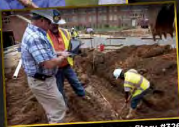
Success Story #326