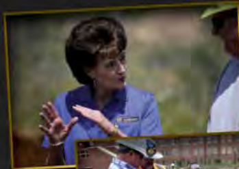
Success Story #187

NON-PROFIT ORGANIZATION U.S. Postage Paid Permit #68 Wichita, KS 672