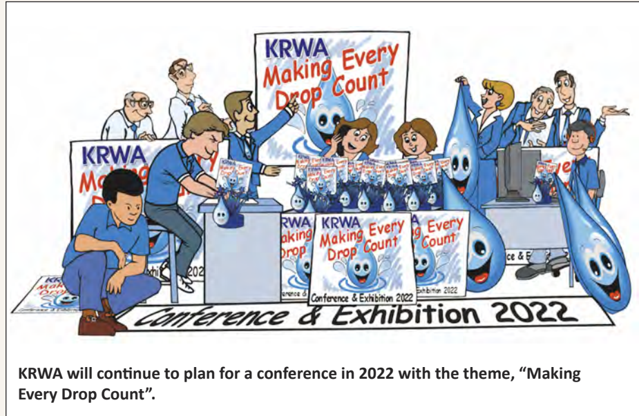
KRWA will continue to plan for a conference in 2022 with the theme, “Making Every Drop Count”.

2. Essential Workers: People who attend the conference from communities large and small across Kansas and some surrounding states, are ESSENTIAL WORKERS. In many communities there are already too few utility workers. The risk of having so many of these heavily depended-on persons gathered at one event with the potential spread of the virus would border on malfeasance.