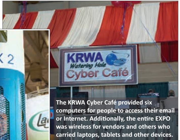
The KRWA Cyber Café provided six computers for people to access their email or Internet. Additionally, the entire EXPO was wireless for vendors and others who carried laptops, tablets and other devices.